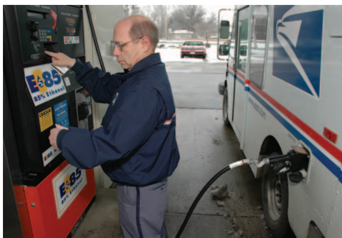
Caption here.

alternative fuels in AFVs, among others. Unlike Standard Compliance, under Alternative Compliance there is no cap on the portion of requirements that can be met through biodiesel use, nor must biodiesel be used in blends of at least 20%.