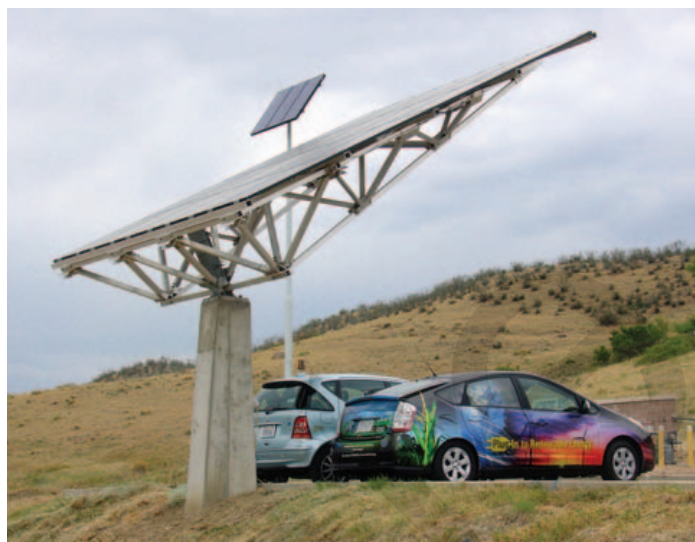
FPL provides electricity to more than 4.5 million customers in Florida and relies on its 2-million-gallon B20 storage tank to ensure a stable supply of biodiesel.

"FPL's biodiesel program, in conjunction with other measures like HEVs and improved vehicle efficiency, has created an opportunity to operate a large fleet on renewable fuels and to lower emissions dramatically—at an affordable cost," says Survant.