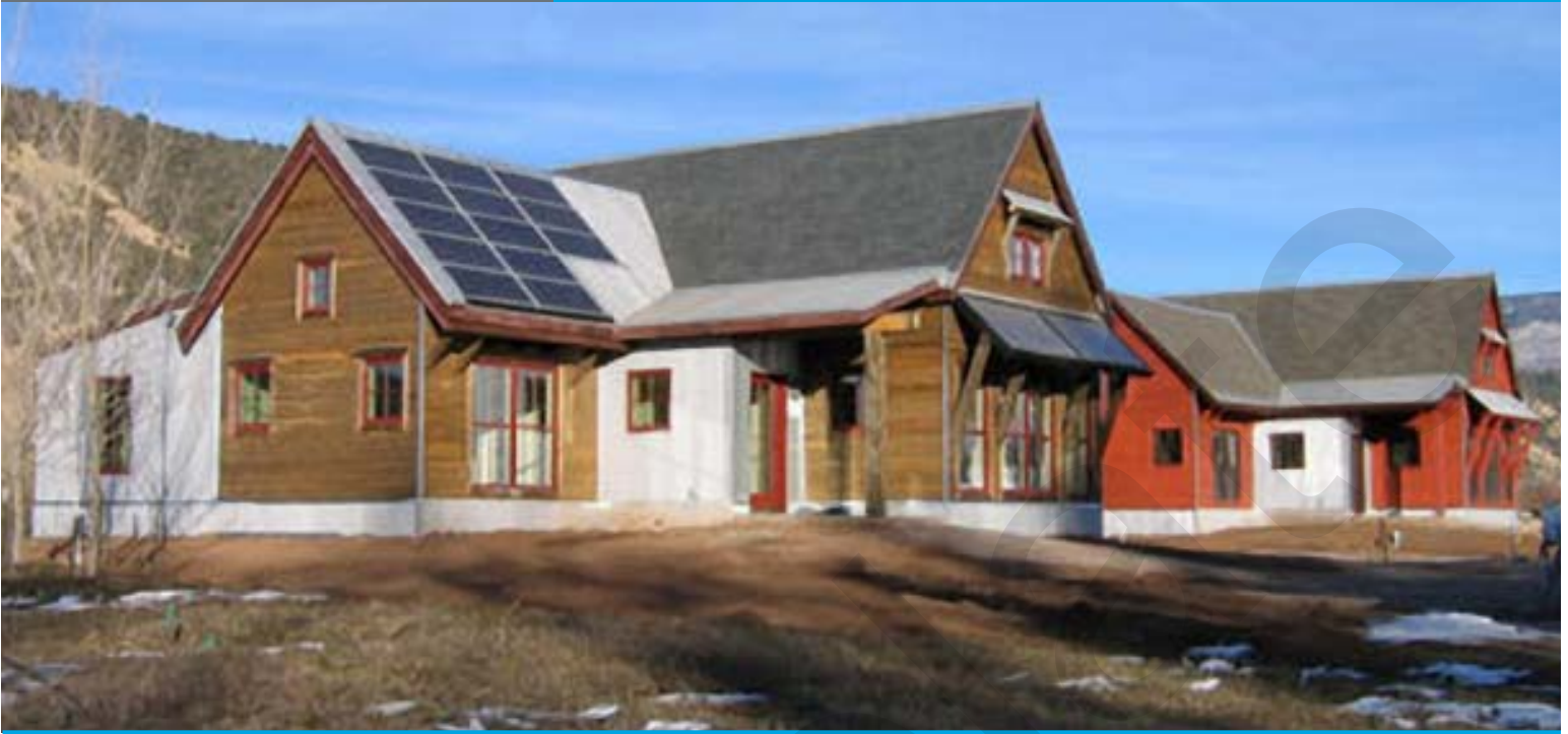
Caption. Photo credit