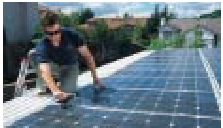
Caption here. Photo credit

The Recovery Act offers financial incentives for EERE awards Energy Efficiency and Conservation Block Grants to local governments, states, U.S. territories and Indian tribes to support activities that reduce energy use and fossil fuel emissions, create jobs, and improve energy efficiency in all sectors. The funding supports energy audits and energy efficiency retrofits in residential and commercial buildings, the development and implementation of advanced building codes and inspections, and the creation of financial incentive programs for energy efficiency improvements.